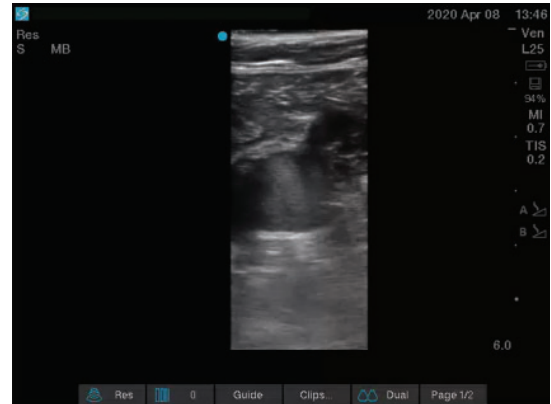
Figure 2. Another short-axis view of the femoral vein (center) and the femoral artery (bottom right) at the site of the saphenous vein inflow (top right). Swirling pattern of high echogenicity suggests low-flow state.

The characteristic laboratory findings of CAC (ie, dramatically elevated levels of D-dimer and fibrin degradation products) indicate a highly thrombotic state with high fibrin turnover. How-