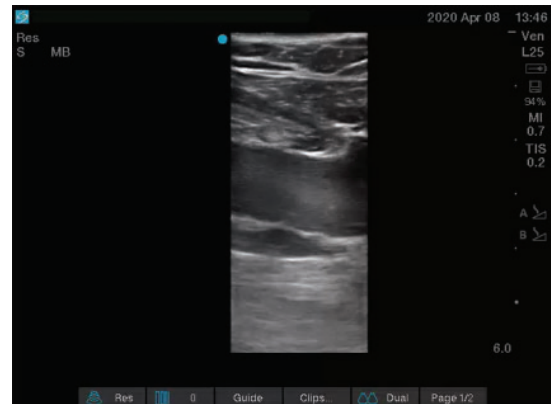
Figure 3. Long-axis view of the femoral vein, with spontaneous echogenicity and slow flow.

ever, other markers of disseminated intravascular coagulation remain relatively unchanged. 7 The prothrombin time and activated partial thromboplastin time are only mildly prolonged, if at all, and platelet counts are usually normal or only mildly low ( 100\text{--}150 \times 10^9/\text{L} ). 8–10