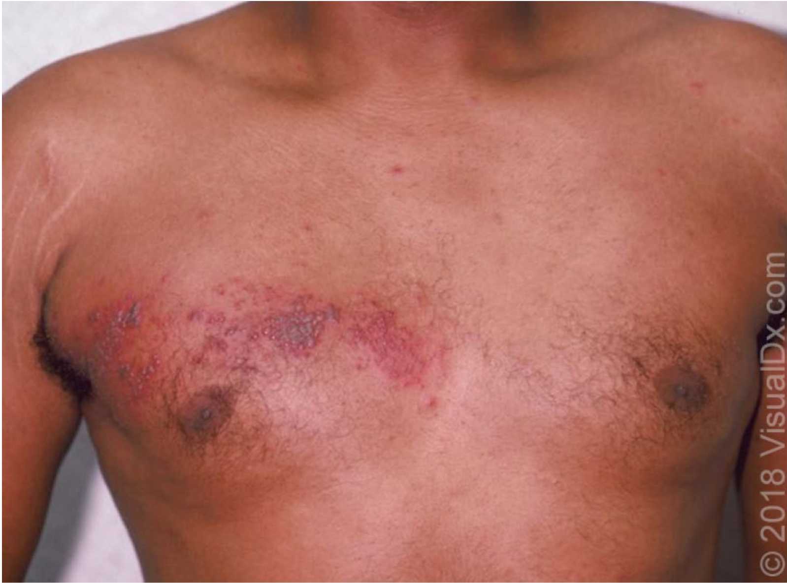
Grouped vesicles and erythema in a dermatomal distribution.