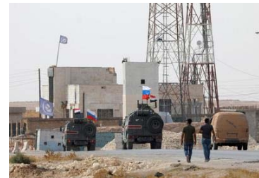
Russia says U.S. presence in Syria illegal, protects oil smugglers