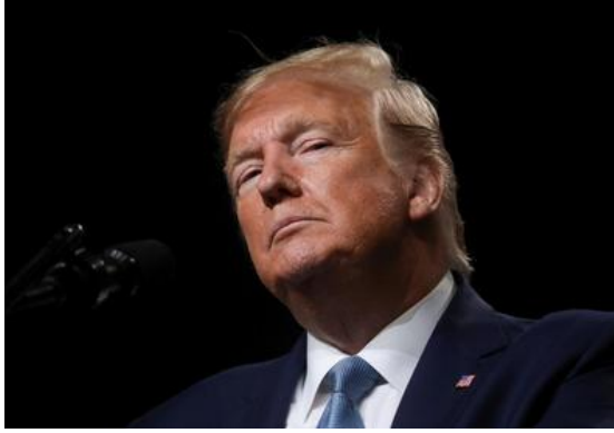
Lawmakers hear from 'corroborating' witness in Trump impeachment probe