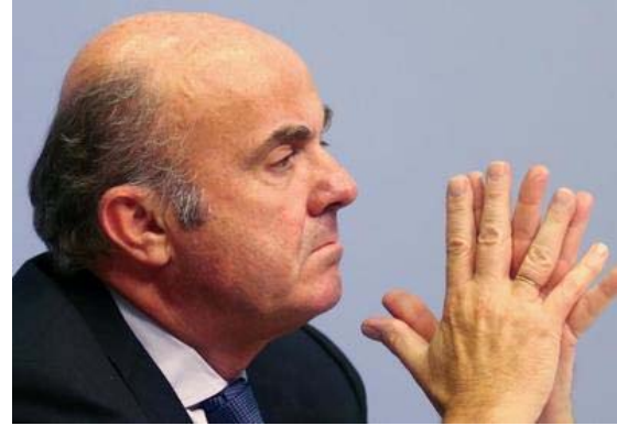
Lagarde will take ECB out of ivory tower: De Guindos in El Pais