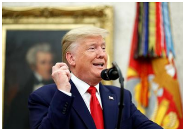
U.S. Attorney General Barr's review of Russia probe faces backlash