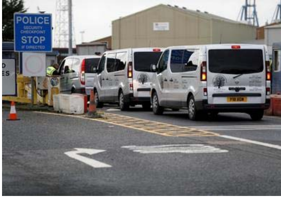
Rural Vietnamese mourn loved ones feared dead in back of British truck