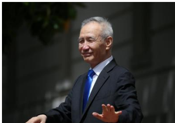
Tech consultations on parts of U.S. trade deal completed: China's...