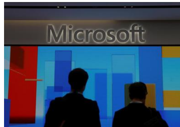
Microsoft beats Amazon for Pentagon's $10 billion cloud computing...