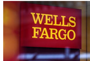
Exclusive: Wells Fargo lays off more than 200 business bankers in...