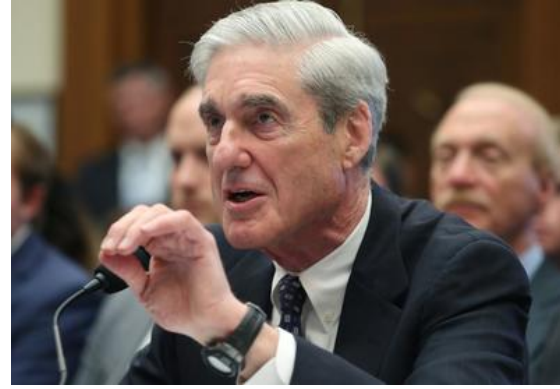
Judge validates Trump impeachment inquiry, orders Mueller document...