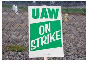
UAW to bargain next with Ford on new contract deal: sources